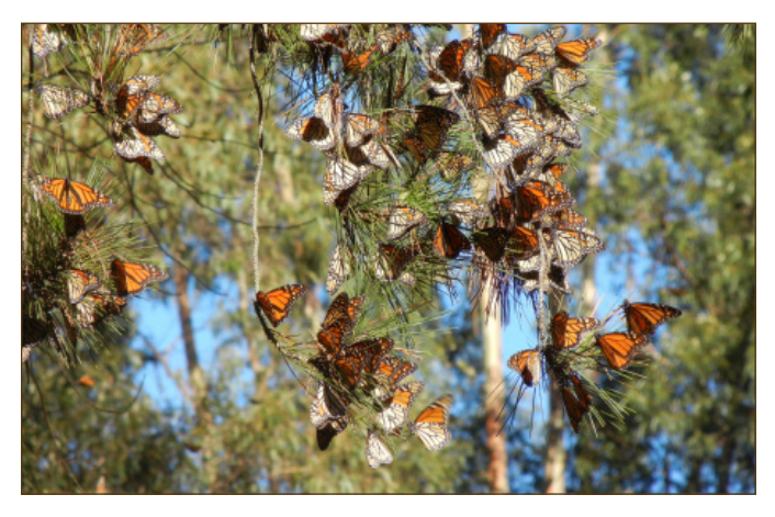
Ventura County plays a key role in the preservation of Western Monarch Butterflies. Photo credit: Xerces Society, Point Lobos, 2010.

As our climate heats up, the stress on the planet and its inhabitants becomes more apparent and one of this year's most impacted species is the beautiful Western Monarch Butterfly. Butterflies of all types were abundant before climate change, urbanization and neonicotinoid insecticides took their toll. Now the iconic Monarch butterfly population that numbered in the millions in the 1980's has precipitously declined